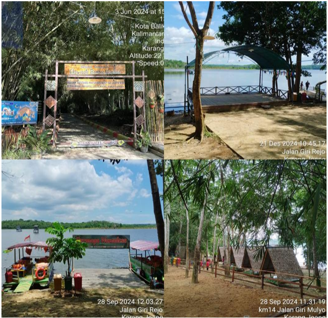
Figure 2. Aspects of Wanadesa Bamboe Forest Tourism

d) Tourist Accommodation. Accommodation or lodging is a place to stay or rest with facilities (Sirait, 2015). The availability of accommodation, especially around the Wanadesa Bamboe Forest tourist attraction, is still very limited, because the tourism management does not have accommodation that is managed directly, but there is accommodation such as villas that are managed privately by the local community. This aspect is one that needs to be considered in Bamboe Wanadesa forest tourism