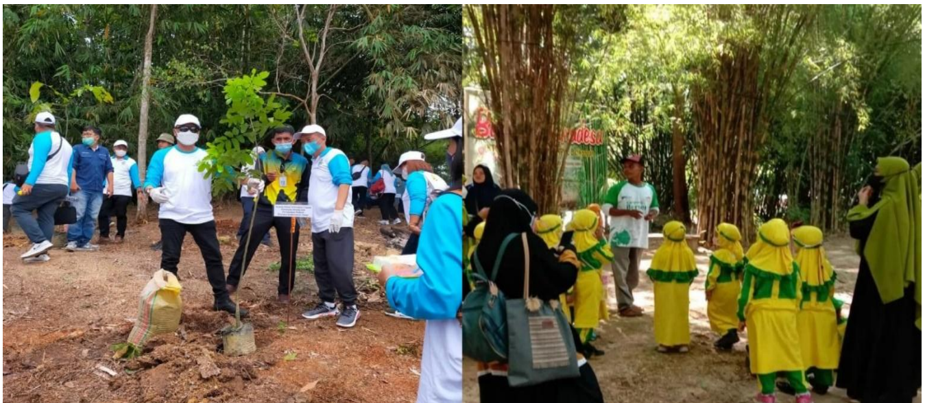
Figure 3. Implementation of Ecotourism in Wanadesa Bamboe Forest Tourism

The success of ecotourism depends on wise management, development of environmentally friendly infrastructure, and active community participation in destination management. This is in accordance with (Habibie, 2021) which states that optimal ecotourism development really requires planning, utilization, control, institutional linkage and community empowerment by taking into account economic, social and ecological principles and involving stakeholders in managing ecotourism potential. The success of Bamboe Wanadesa forest tourism as ecotourism can be seen from how this destination is able to integrate nature conservation, community empowerment, and local economic development, as well as supporting a sustainable approach, this tourism not only provides an interesting tourist experience, but also supports nature conservation and increasing welfare public. Wise management and involvement of various parties, as well as commitment to ecotourism principles, are key factors in ensuring the sustainability and success of this tourism development.